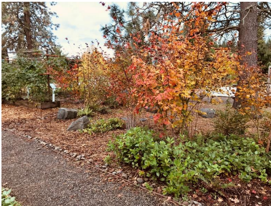
Fall colors in our Nature Scape perennial bed.

We are experiencing security issues with 2 break ins that affected us directly and the result is we will be adding a steel storage unit this Fall.