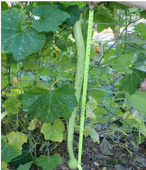
tromboncino squash – 48"

One unique plant we grew which put us in the local papers was tromboncino squash. We had a record length of 48" (4') of one squash. We also successfully grew saffron crocus and harvested some this year.