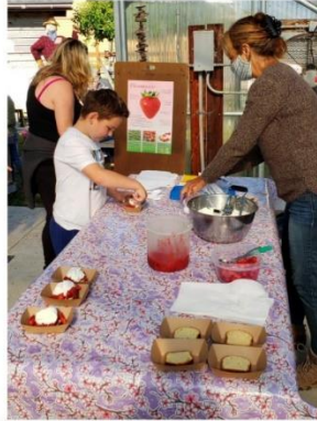
Excited about strawberry shortcake

We also hosted a Summer Garden Camp in July and August for 3--5 graders at the Riley Creek Garden!