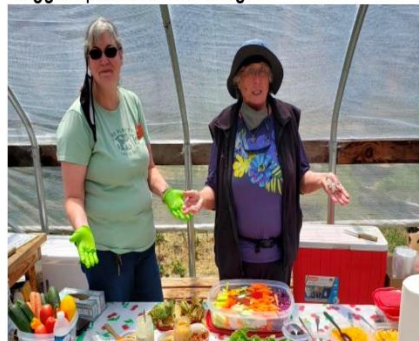
From the garden lettuce wraps with future garden veggie options for the filling

Chetco Seed Library: The Chetco Seed Library cabinet at the library in Brookings is fully stocked. This project supplies free seeds to the community.