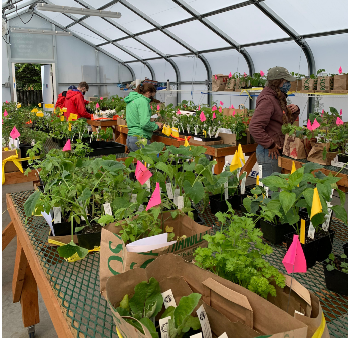
Central Gorge's online-only plant sale, 2021