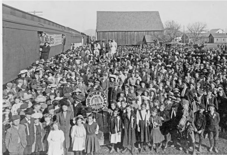
Extension demonstration train at Central Point, 1918