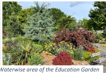
Waterwise area of the Education Garden with 'Blue Ice' Arizona cypress