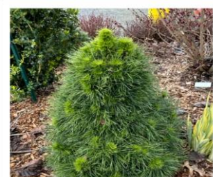
'Green Penguin' Scots pine Pinus sylvestris 'Green Penguin'