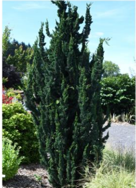
Wissel's Saguaro' Port-Orford-cedar Chamaecyparis lawsoniana 'Wissel's Saguaro'