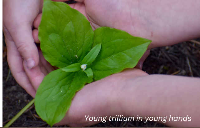
Young trillium in young hands

OMGA Goal #6 for 2023: "The Oregon Master Gardener Association commits to advocating for the OSU Extension Master Gardener™ Program. Through its Advocacy Task Force, the OMGA will seek to garner support from decision-makers (OSU leadership, County and City Commissioners, and the Oregon Legislature) in funding for the OSU Master Gardener Program." https://omga.org