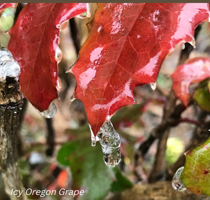
Icy Oregon Grape