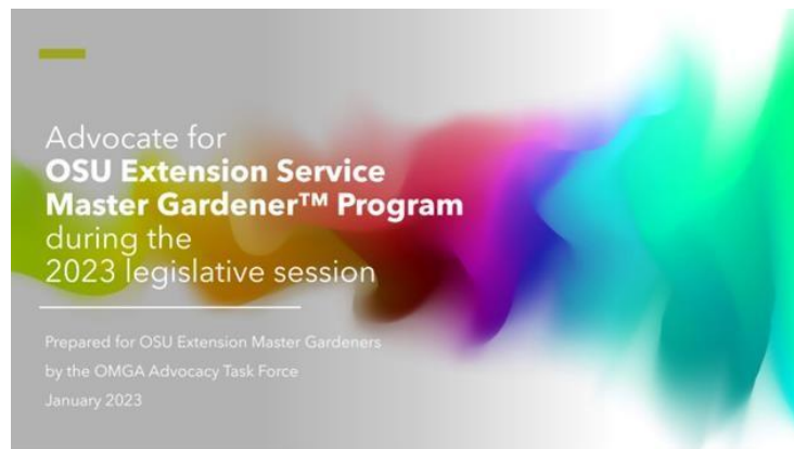
PowerPoint Presentation on Why, What, How, When of advocacy @ https://omga.org/advocacy/