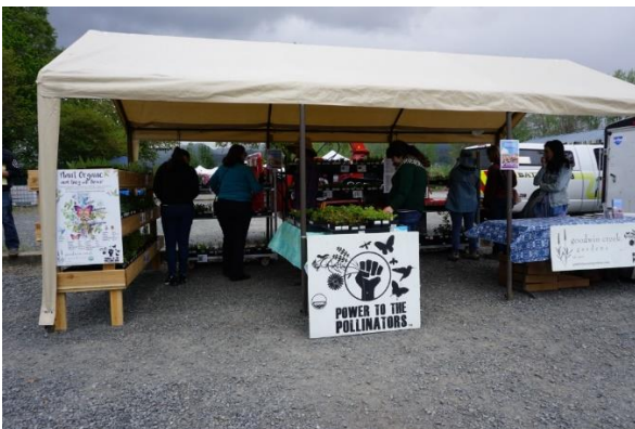
2023 JCMGA Spring Garden Fair – Outdoor Vendors