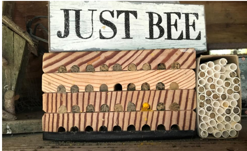
Mason Bee tubes filled as of May 25, 2023

Bee notes newsletter: https://us11.campaign-archive.com/home/?u=4ce1a6600db232cd361f3043c&id=0c5ded5bea