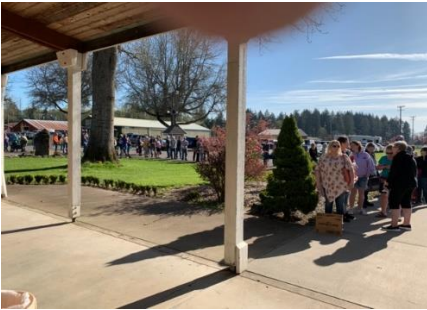
Line around the building before opening

We had great weather, vendors and a fantastic turnout for this year's spring plant sale.