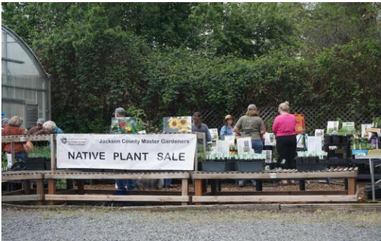
2023 JCMGA Spring Garden Fair (Native Plant Sale)

The one-day event brought in over $14,000 in revenue. The event is planned a year in advance and a new SGF committee is being formed with feedback on what went well and what can be improved!