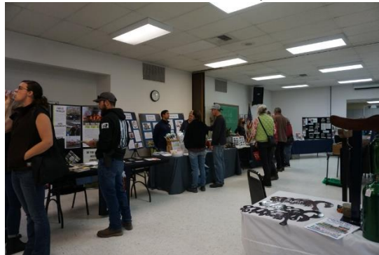
2023 JCMGA Spring Garden Fair Vendor & SOREC presentations