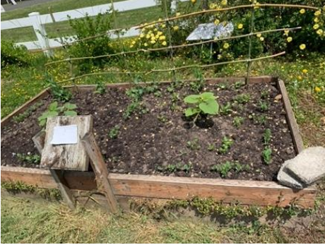
Creative trellis built by seed to supper group.

We also experimented with a short, three-week set of container gardening classes at the St. Helens Food Bank. Seven people registered, but there was a little shifting of attendance with walk-ins wanting to join. The Food Bank was kind enough to share seeds and gardening supplies with the class.