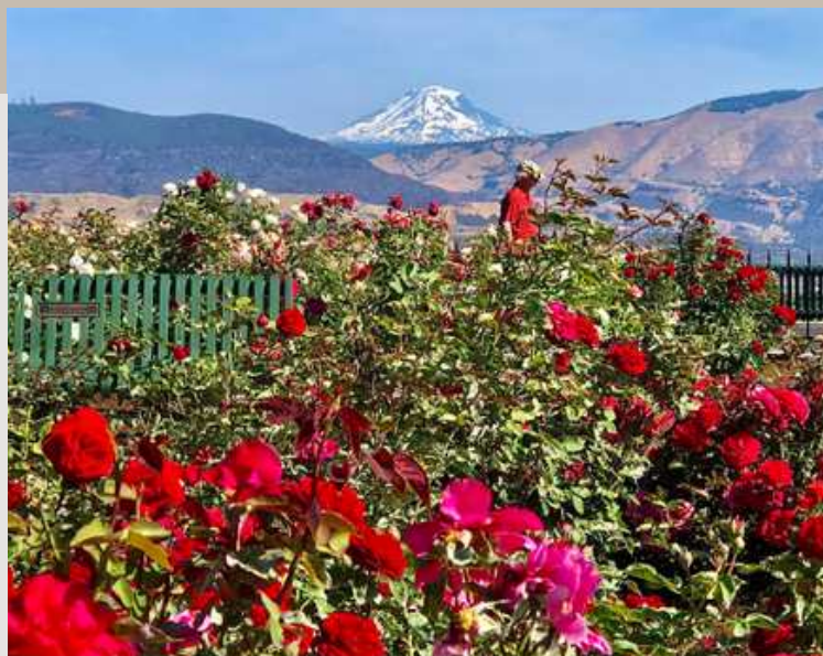
Veteran Memorial Rose Gardens at Sorosis Park, The Dalles